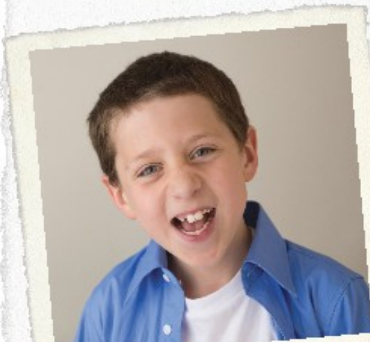
Photo ID required